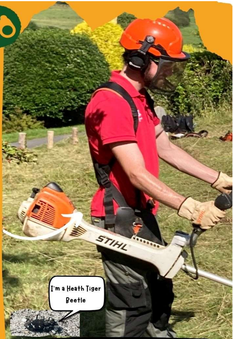
I'm a Heath Tiger Beetle

"Seeing and understanding behind the scenes of places that I have spent so much time in growing up has been brilliant"